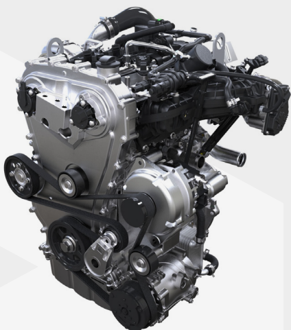
>> Downsizing engine

By drawing on our involvement with many modern powertrains currently in the marketplace, MAHLE Powertrain are able to combine a deep understanding of each component; with a holistic, whole-system engineering approach that recognises the complex interactions that can occur between them.