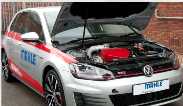
>> eSupercharged DI-3 vehicle