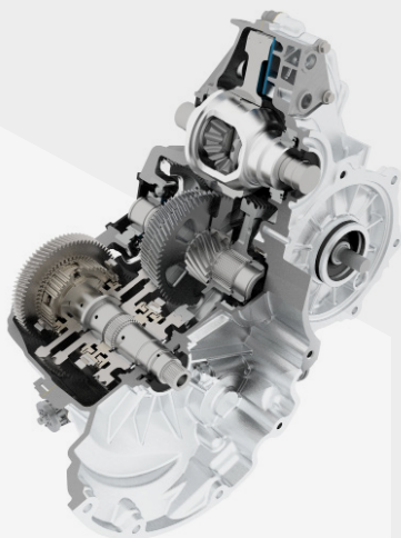
>> Compact 4-speed transmission

Electric vehicles, or hybrids with pure electric drive, do not require such a wide range of fixed ratio gears within the transmission, as their electric traction motors are capable of a much greater range of operating speeds, but reduction gears are often still required to match optimum motor speed with road speed. Electric motors provide maximum torque output from zero which then gradually decreases with speed, so the transmission gears must be designed with this in mind.