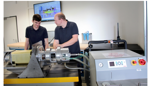
>> Modular test rig